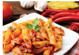
Vegetarian Wheat Pasta