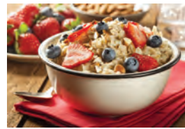
Oatmeal with Berries

People following a vegetarian diet should become informed about the principles of good nutrition. These include choosing foods high in fiber, complex carbohydrates, vitamins and minerals, and knowing which foods are best to eat organic, when possible (see "The Dirty Dozen" at www.ewg.org ).