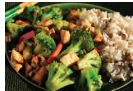
Asian Vegetable Stir Fry