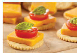
Cheese and Crackers with Tomato