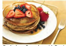
Buckwheat Pancakes with Berries