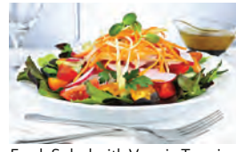
Fresh Salad with Veggie Toppings